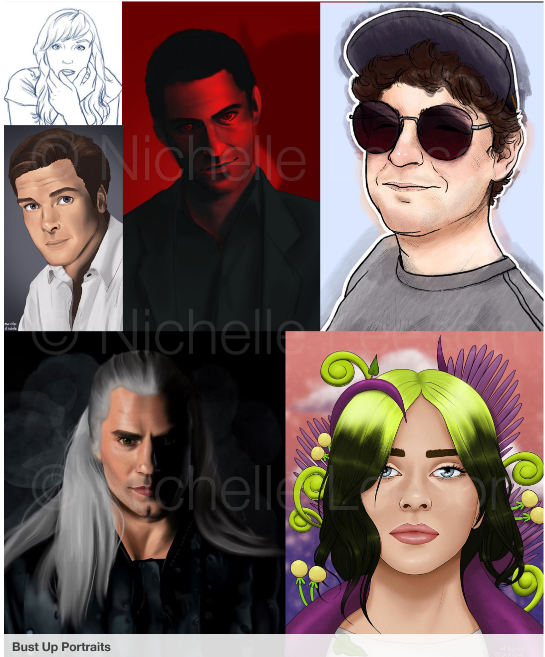
Bust Up Portraits

The following is a small selection of my works. To see more examples, please visit my Instagram and Facebook pages for the most comprehensive collections!