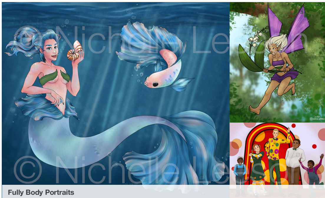
Fully Body Portraits